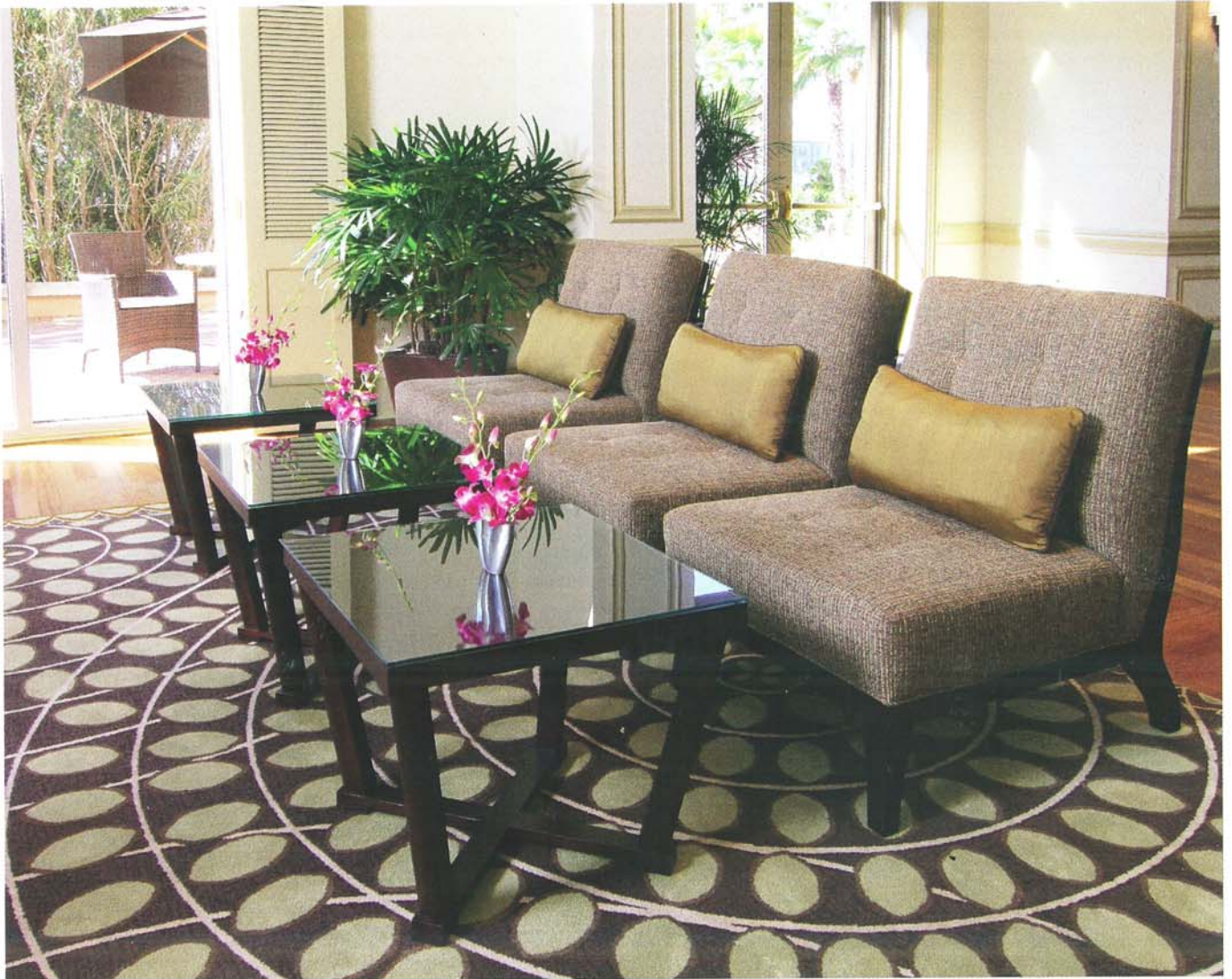
Opposite page and above: Two views of the seating niches in the Westin Savannah lobby.